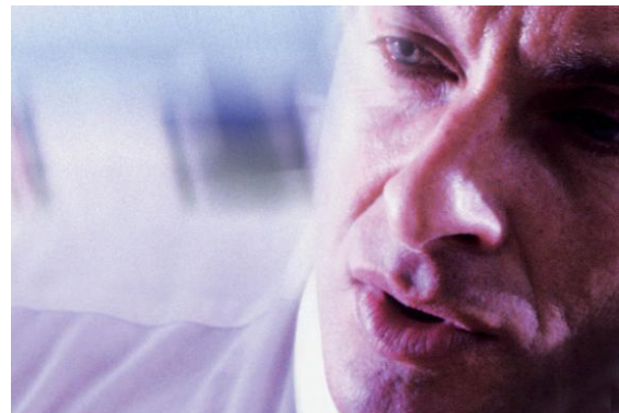
A Green Point!

Interspace Industries 126 Great North Rd, Unit 1A, Hatfield. Herts. AL9 5JN Tel 0870 770 8088 Fax: 0870 770 8089 email: moreinfo@interspaceind.com